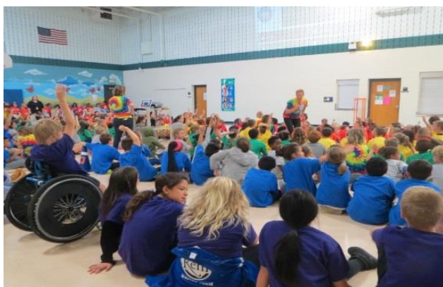
Students present their classroom flags at an Olympic Assembly Oct. 9.