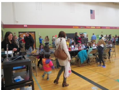
Families enjoyed the activities at our Innovation Fair