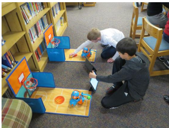
Students participate in Hour of Code Activities throughout December, 2017